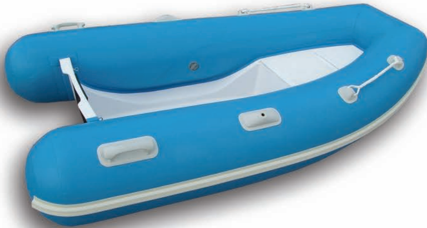
FOCCHI 230 flat