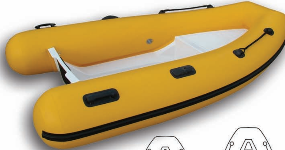
FOCCHI 250 flat